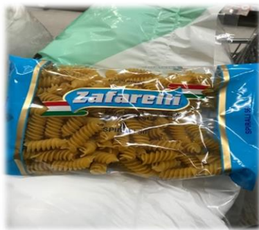
Zafarelli Spirali 56