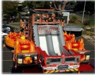
Fire Rescue Challenge