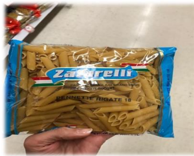
Pennette Rigate 18