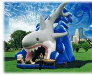
Giant Inflatable Slide